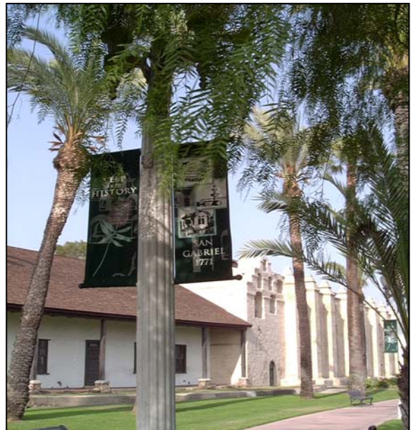
A large part of today's Mission Plaza was reclaimed by closing a portion of old Mission Road. Without much vacant land, San Gabriel must look to these types of solutions to find needed parkland and open space.