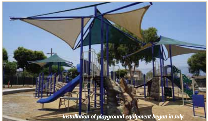
Installation of playground equipment began in July.

Because the park will occupy a little over two acres, city officials are encouraging the use of active transportation for residents who wish to access the site. "It really is a community park. We're encouraging people to use active transportation – such as walking