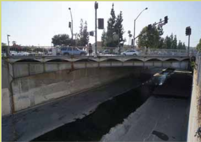
The Alhambra Wash bridge replacement project is currently in design phase.

If you would like more information on any of these projects, please contact Public Works at 626.308.2825.